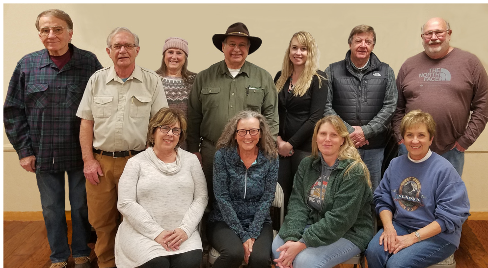
2020 Board of Directors and Board Members