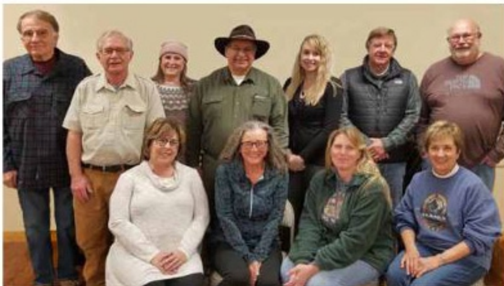
2021 Board of Directors and Board Members